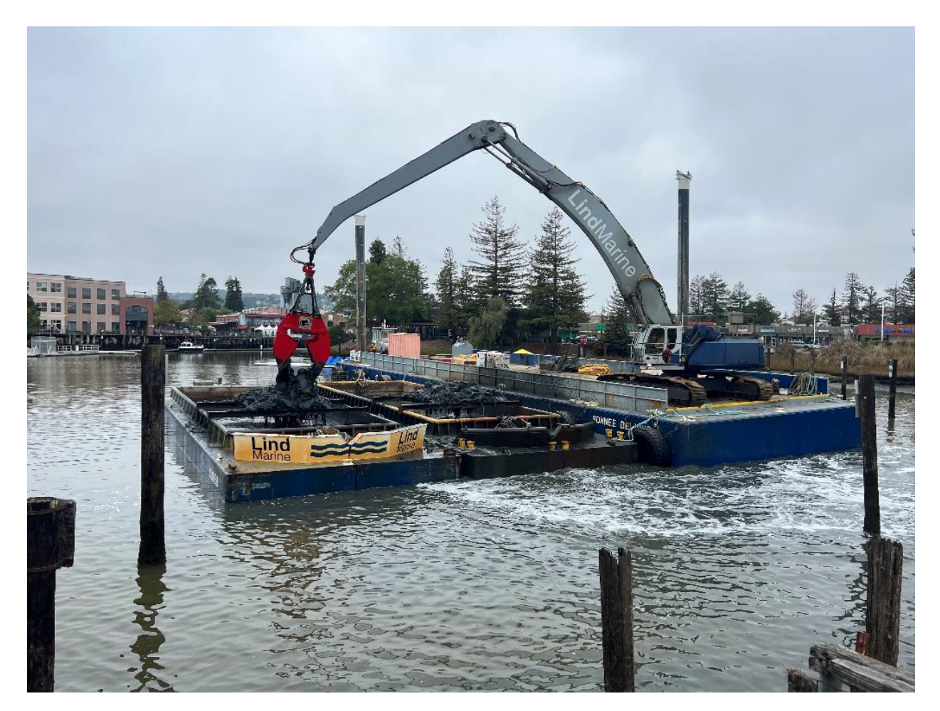
Figure 2: Turning Basin Dredging – Loading Scow for Transport to Designated Deposit Site