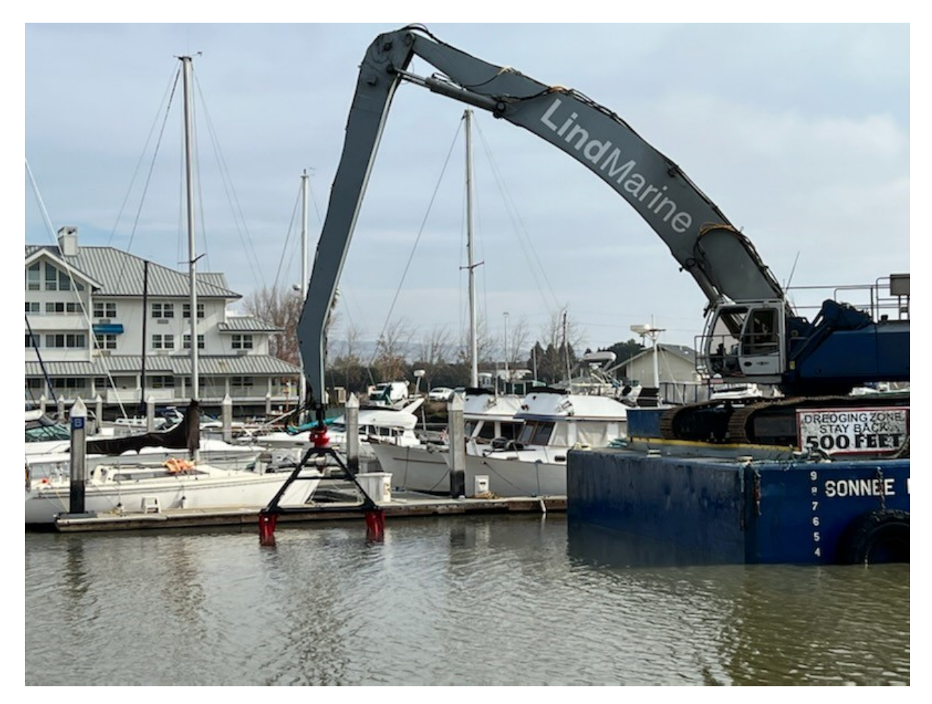
Figure 5: Dredging Alongside Dock at Petaluma Marina