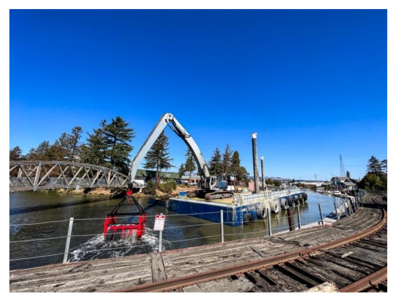
Figure 1: Clamshell Dredging Near the Trestle and Balshaw Bridge in the Turning Basin