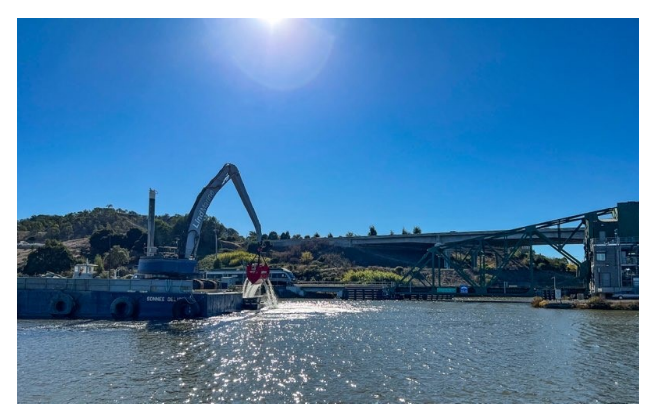
Figure 4: Dredging in the Petaluma Marina